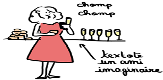
1. SQUATTER LE BUFFET