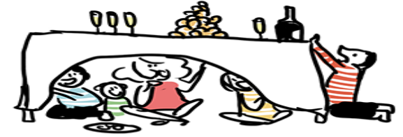
6. SYMPATHISER AVEC LES ENFANTS D'HONNEUR