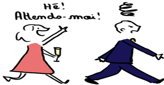
4. NE PLUS LA LÂCHER