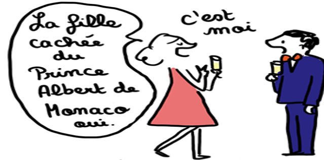
2. S'INVENTER UNE NOUVELLE PERSONNALITÉ