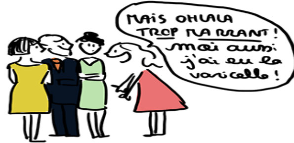
5. S'INCRUSTER DANS UNE CONVERSATION