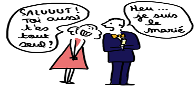
3. REPÉRER UNE AUTRE ÂME ESSEULÉE